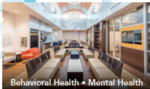
Behavioral Health • Mental Health