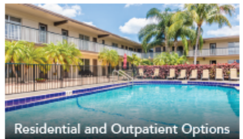
Residential and Outpatient Options